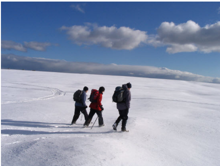
On Byland Moor, York Group walk from Coxwold, February 10 th 2010.

A special thank you from Central Office to all volunteers who were involved in the 2009-2010 Festival of Winter Walks. It was once again a huge success, with more than 880 walks offered across the country and over 15,500 participants.