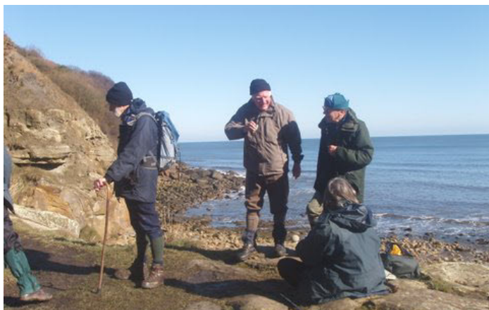
Scarborough Group walk, March 7 th 2010 from Cloughton

The task of choosing the route of the English Coastal Path has now begun. Over the next two to three years the East Riding of Yorkshire Council will be drawing up proposals concerning the alignment of the path along its stretch of the coast and the extent of any spreading room. Landowners will be consulted and public and private interests assessed and balanced. We plan to undertake our own survey in order to be in a position to be able to make informed input into any consultation process. If you would like to help by surveying a section of the route, please contact Tom Halstead, Area Access Officer.