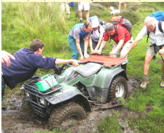
'Ramblers take ban on off-road vehicles into their own hands'

(More photos and winning captions overleaf)